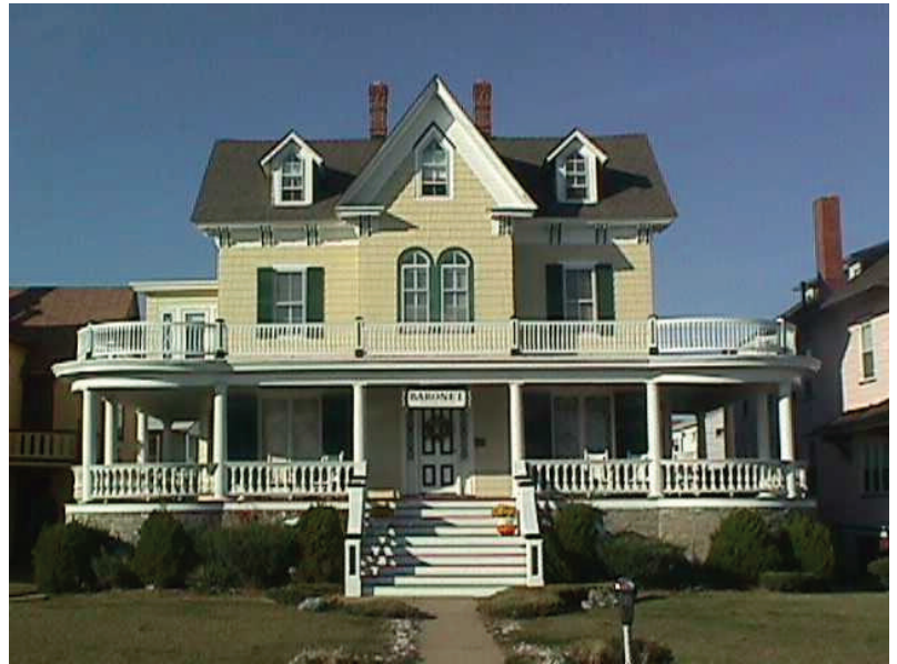
“Baronet” Condo Unit I-F 819 Beach Ave. Cape May, NJ 08204