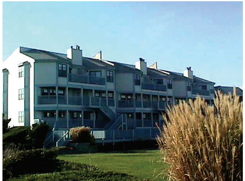
"Capers" Condo Unit #203 227 Beach Ave. Cape May, NJ 08204