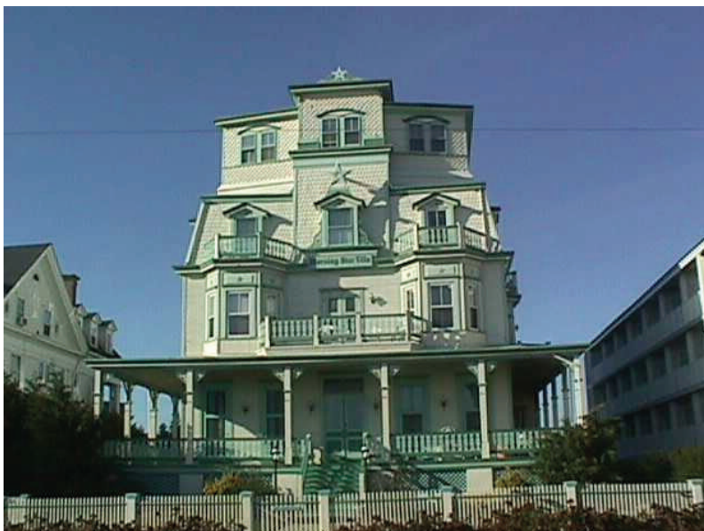
“Morning Star Villa” Unit #8 1307 Beach Ave. Cape May, NJ 08204