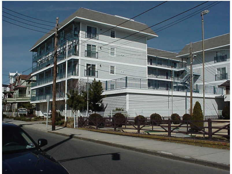
"The Tides" Unit #403 5-9 Jackson Street Cape May, NJ 08204