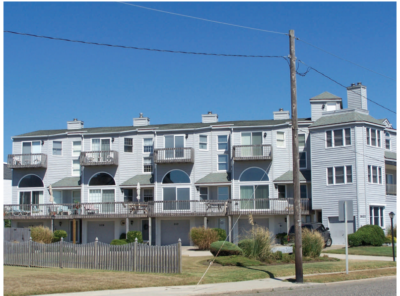
“Victoria’s Walk” Condo Unit #108 1621 Beach Ave. Cape May, NJ 08204