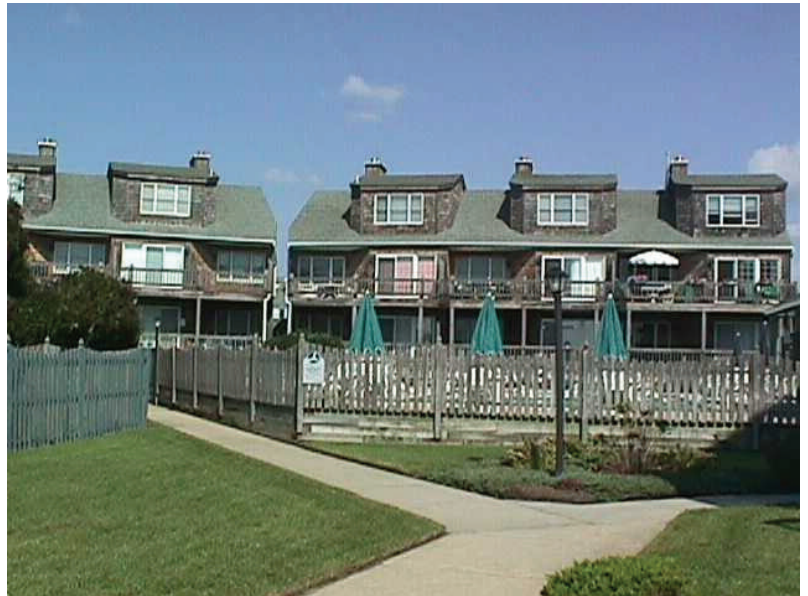
"Victoria's Walk" Condo Unit #202 1621 Beach Ave. Cape May, NJ 08204