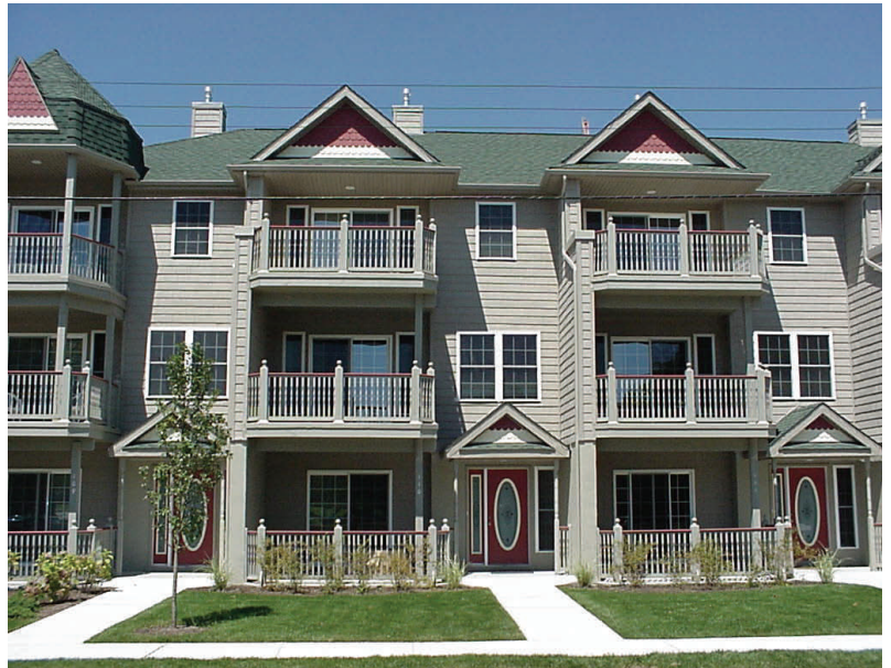
Victorian Cove #110 1005 Pittsburgh Ave. Cape May, NJ 08204